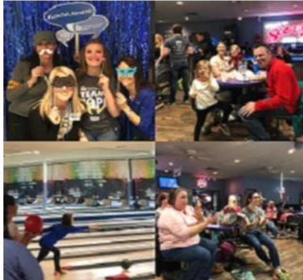
Strike Out HD Fun!

We had a BLAST this Spring! First at our annual Strike Out HD bowling event at Scorz Sports Center and then at the wine tasting event hosted by Skybox Grill & Bar with proceeds benefiting our HDSA Omaha Affiliate! Thanks so much to all who came out and made these events so much fun!!!