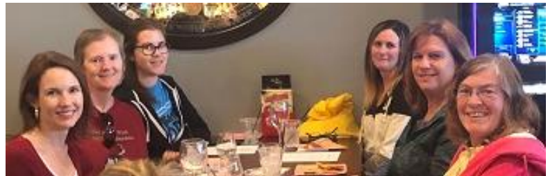
Smiles all around at the wine tasting event